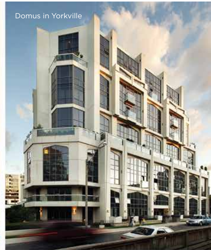
Domus in Yorkville