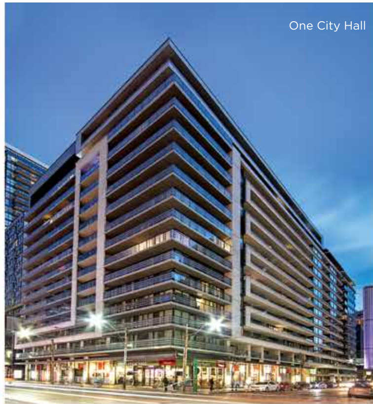
One City Hall