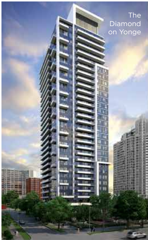
The Diamond on Yonge