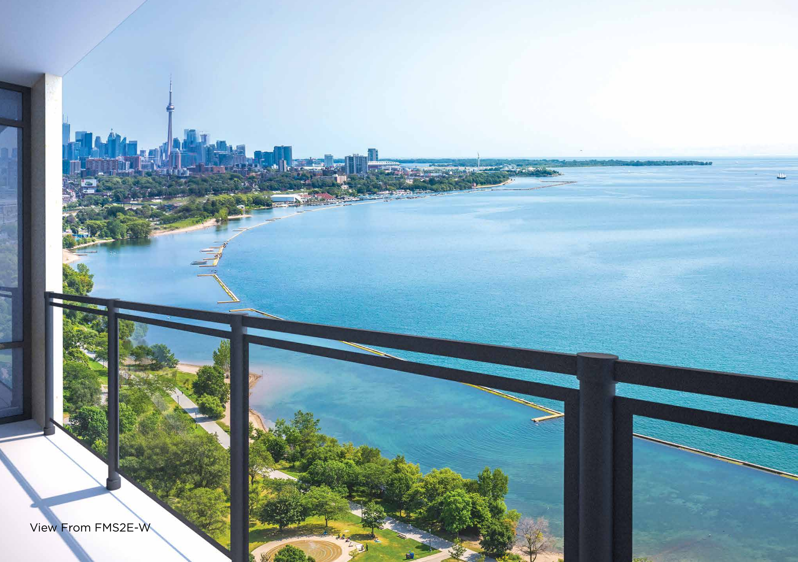
View From FMS2E-W