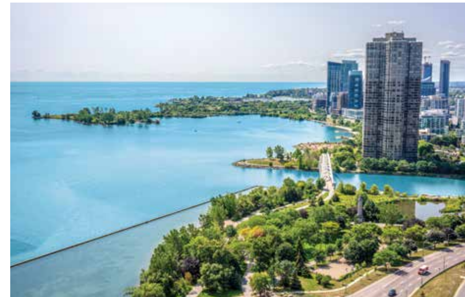
View to the South-West