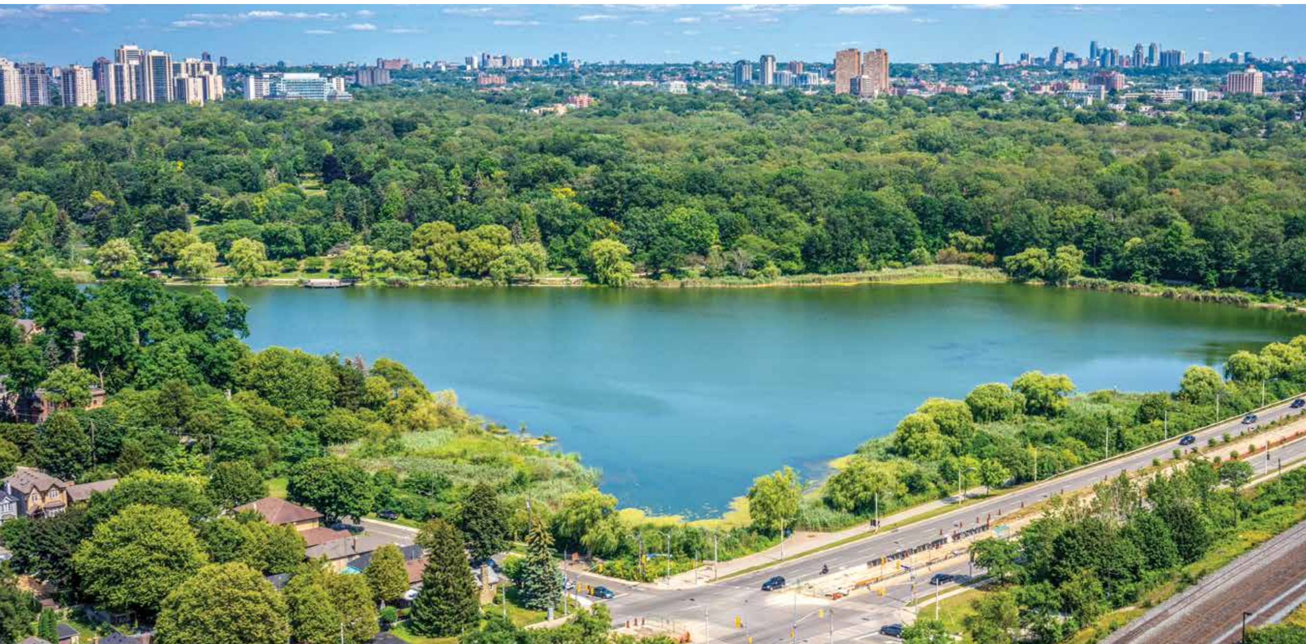
View to the North-East