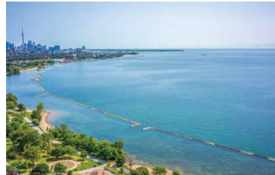
View to the South-East