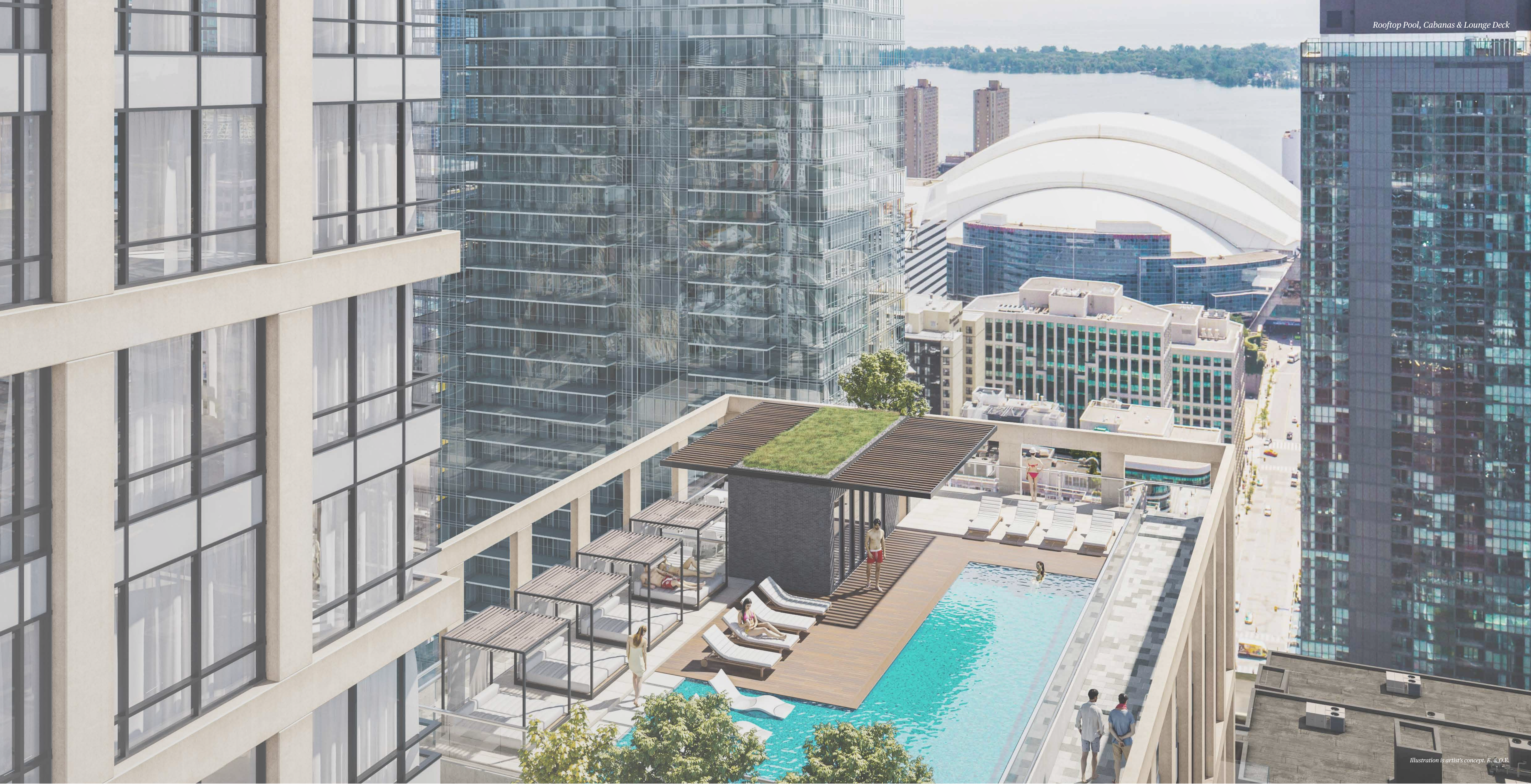
Illustration is artist's concept. F. & O.E.