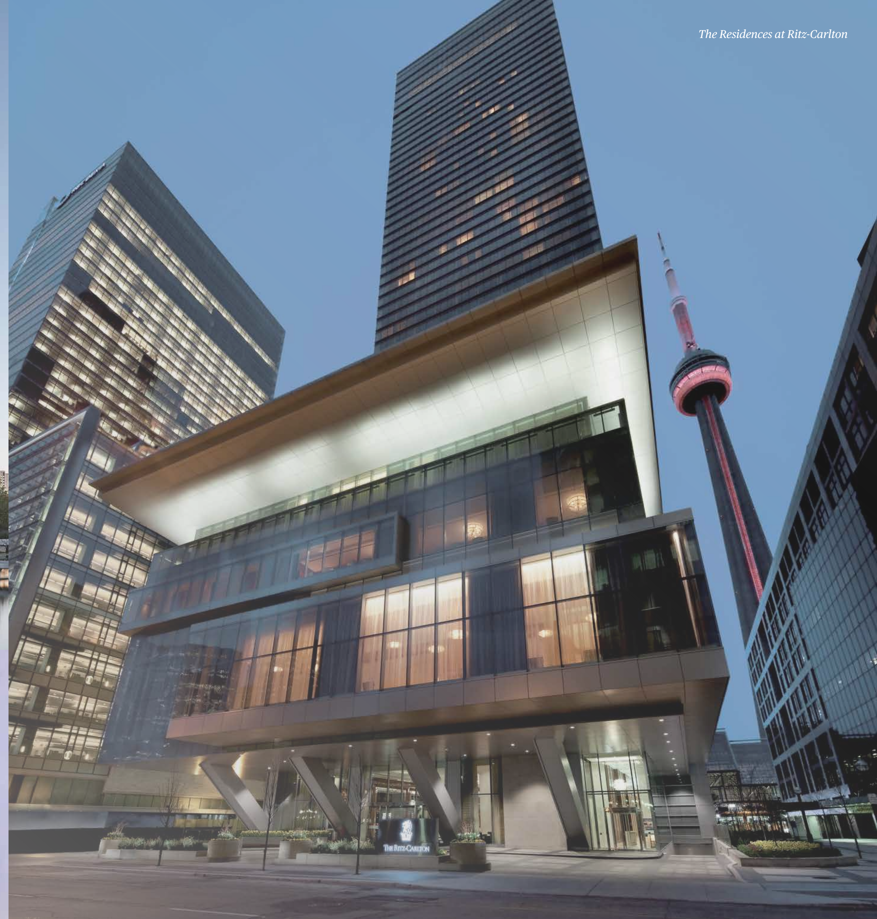
The Residences at Ritz-Carlton