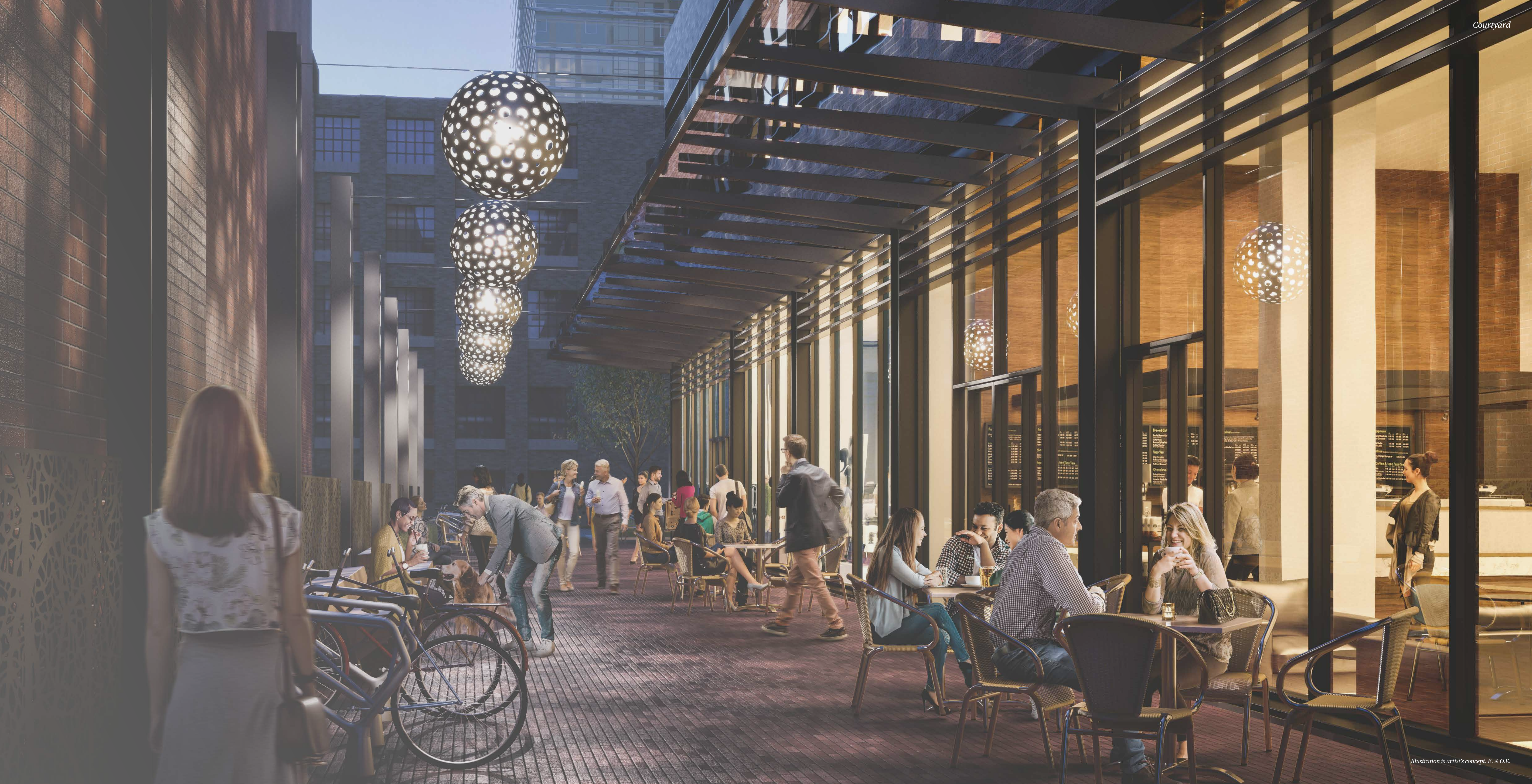
Illustration is artist's concept. E. & O.E.