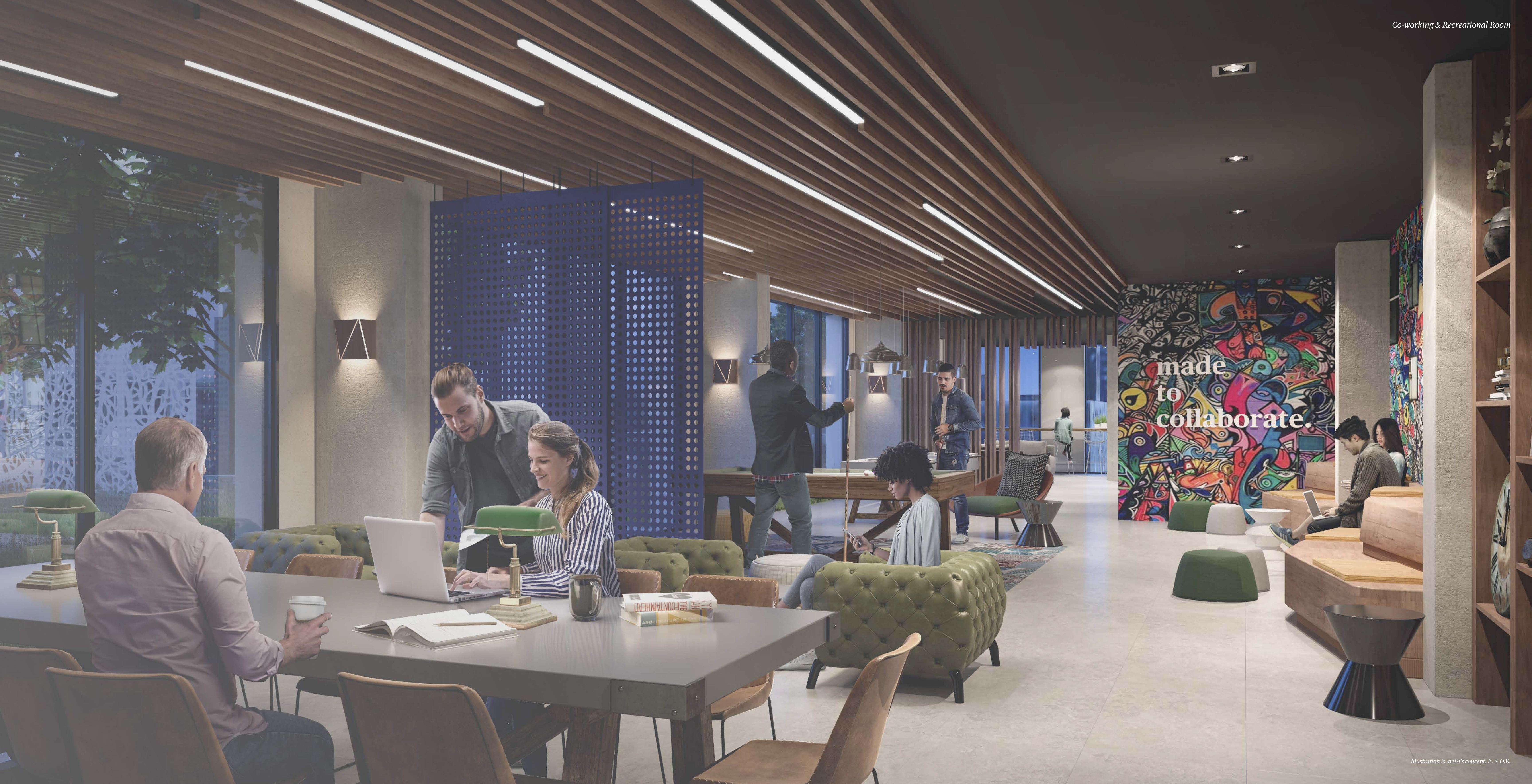
Illustration is artist's concept. E. & O.E.