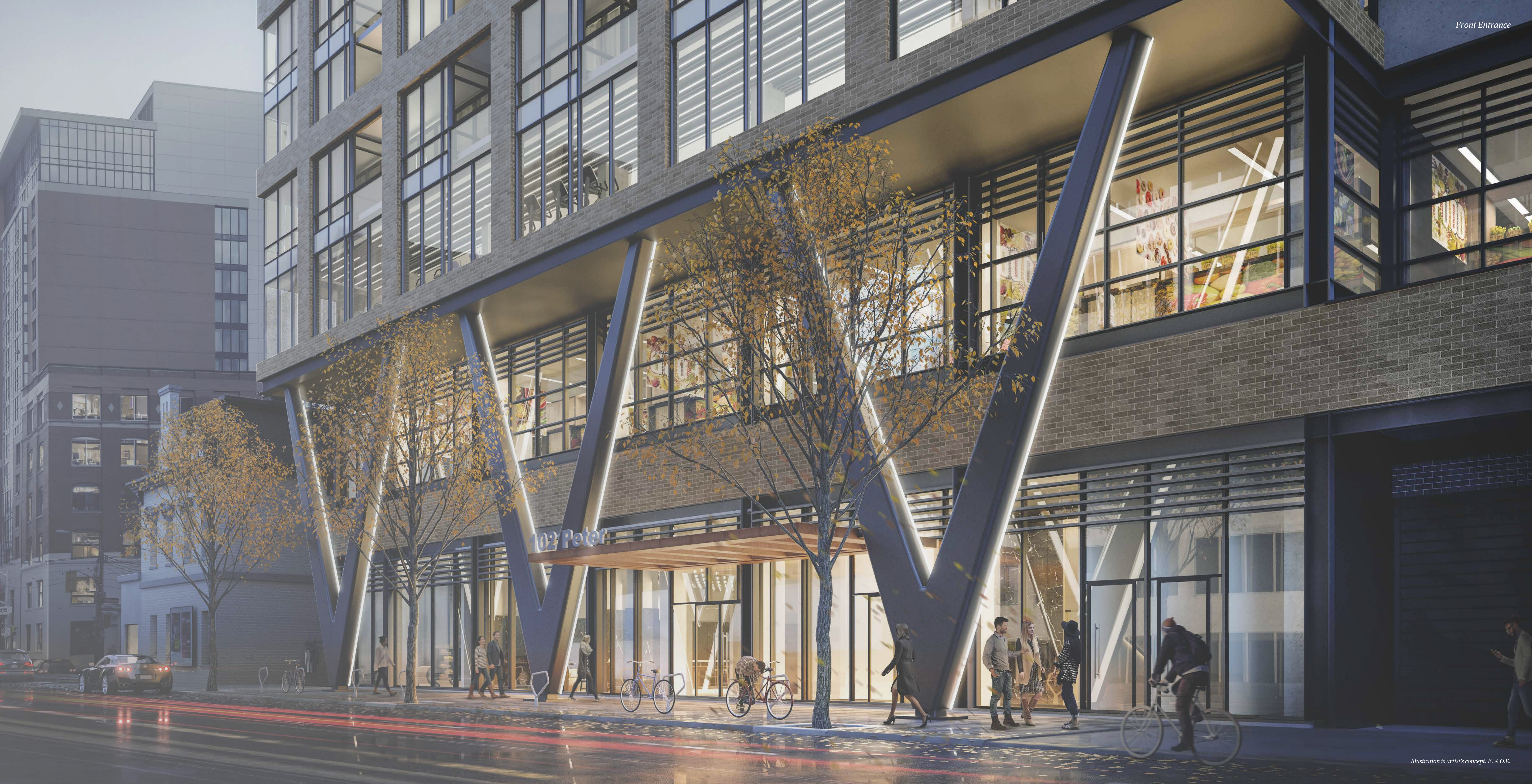
Illustration is artist's concept. E. & O.E.